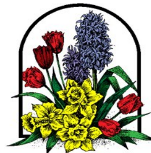
Easter Memorial Flowers

As is our tradition, we will have spring flowers in memory or in honor of someone as a part of our service for Easter Sunday. These can be Easter lilies or any spring flower you like. Please purchase the flowers from the place of your choice and have them delivered or drop them at the church any time after April 13. Before April 14, please call the church office or drop us a note listing the names the flowers are in memory or in honor of and who gave the flowers. Please plan to pick your flowers up after worship on Easter Sunday.